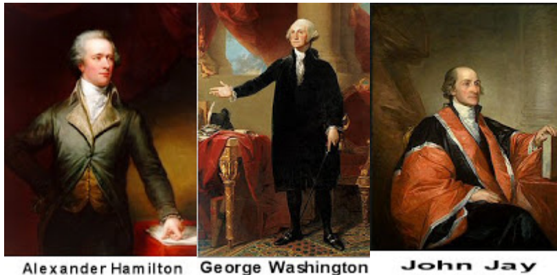
Alexander Hamilton George Washington John Jay